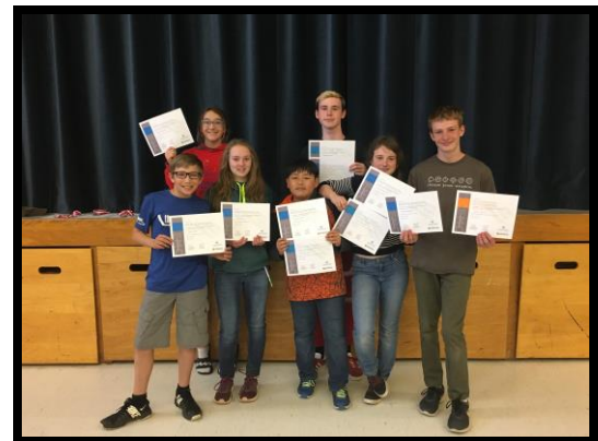
Gauss Math Contest Winners!