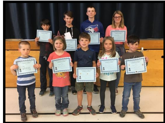
May Merit Award Winners!